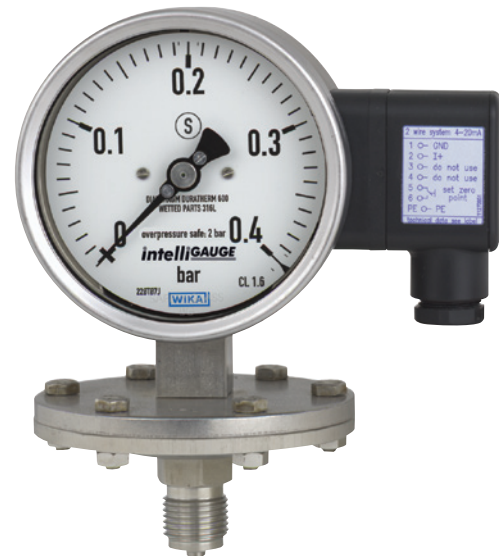
intelliGAUGE model PGT43,100