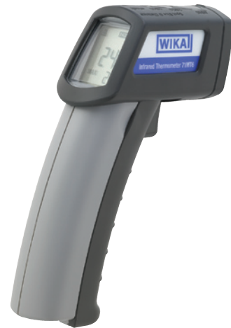
Infrared Hand-Held Thermometer Model CTH71ST6