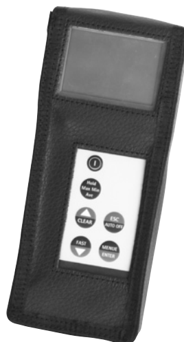
Hand-Held Thermometer CTH6510