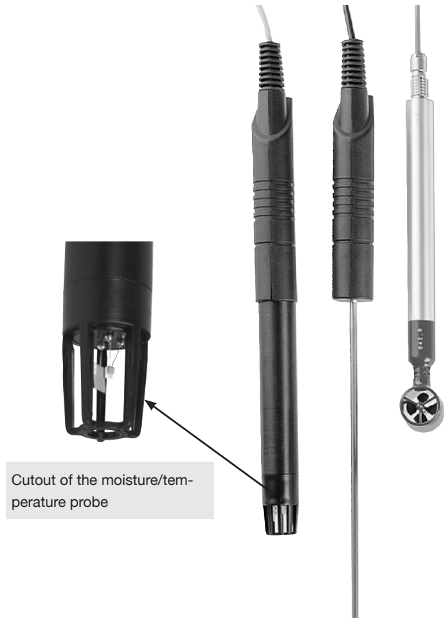
Fig. left: Moisture/temperature probe